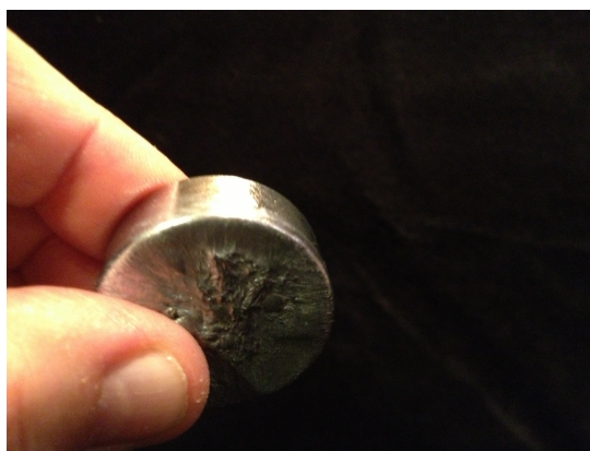
A close-up image of a small gallium disk (about the same diameter as a quarter, but about 5× thicker) held between a person's thumb and forefinger. Near the person's thumb, the surface of the disk appears rumpled; this is because the person's skin is warm enough to melt the gallium.

Water changes phase from solid to liquid (and back again) at its melting (and freezing) point of 0^{\circ}\text{C} ( 32^{\circ}\text{F} ). Metals such as aluminum, iron, and gold melt at much higher temperatures. Iron, for instance, has a melting point of 1530^{\circ}\text{C} ( 2786^{\circ}\text{F} ). It's understandable, then, that most people would be surprised to find that there is a metal that has a melting point of 29.9^{\circ}\text{C} ( 85.8^{\circ}\text{F} ) — less than typical human body temperature. That metal is gallium . Gallium is a silvery gray metal, somewhat similar in appearance to mercury. Its molecules interact with the molecules in glass and other materials, creating a silvery mirror finish on surfaces. Gallium is solid at room temperature, but if you warm it up just a little, it will transition into liquid. If you cool it down just a bit, it reaches its freezing point, 29.9^{\circ}\text{C} ( 85.8^{\circ}\text{F} ), and becomes a solid again.